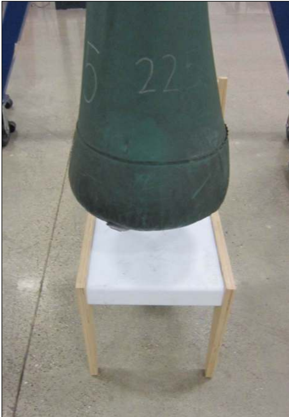
DROP TEST – DYNAMIC