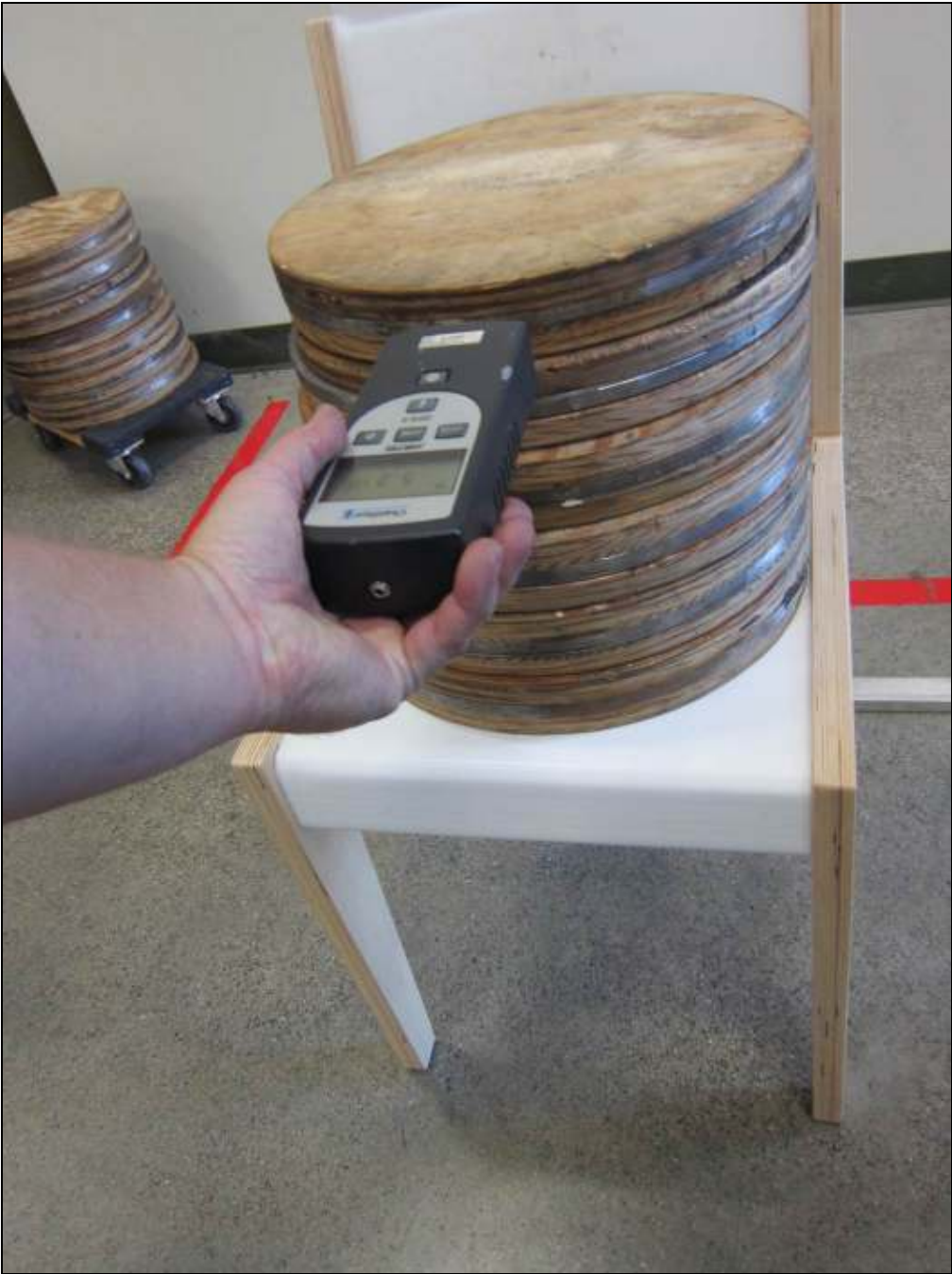
Stability Test - Rear