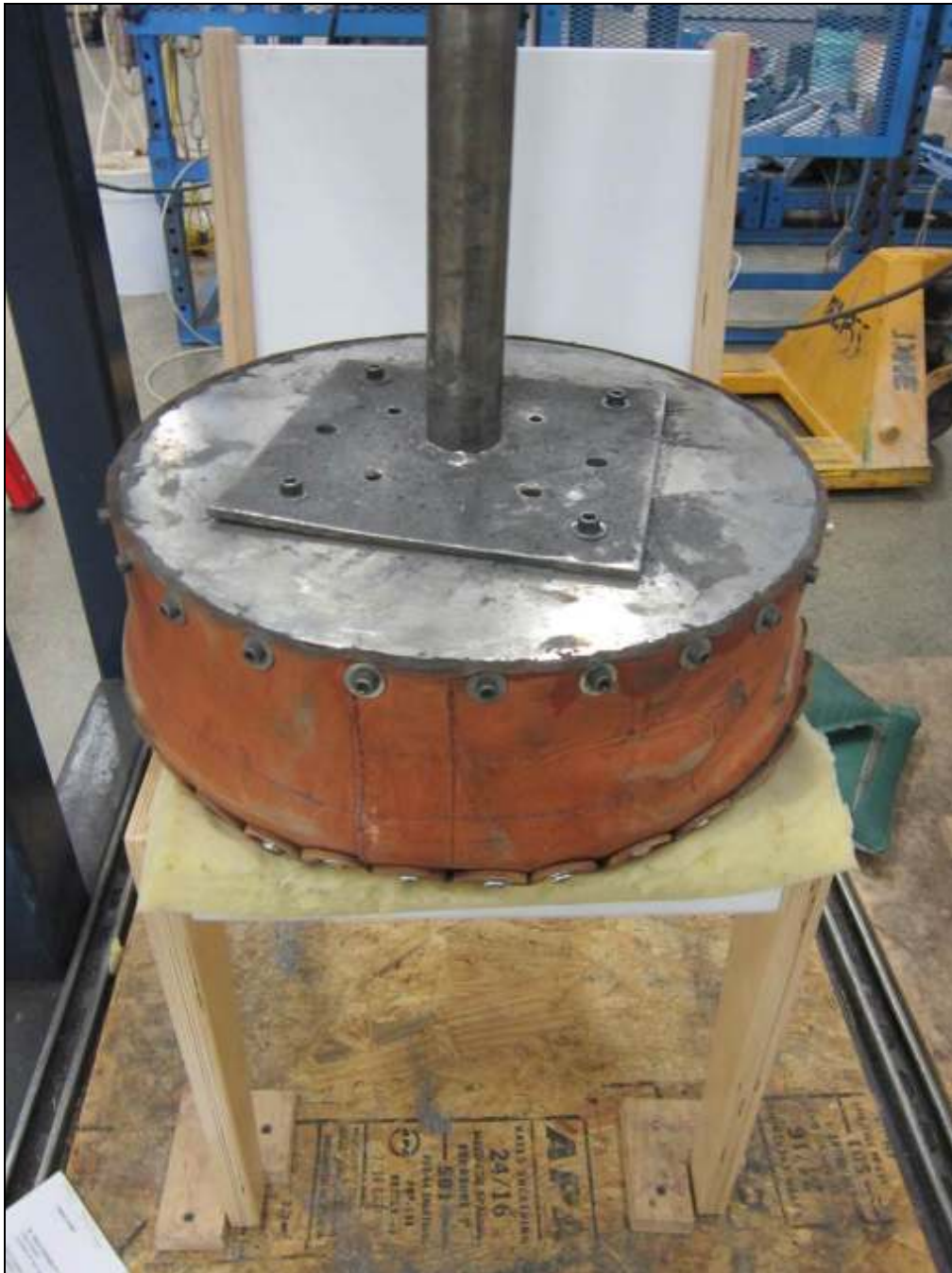
Seating Impact Test