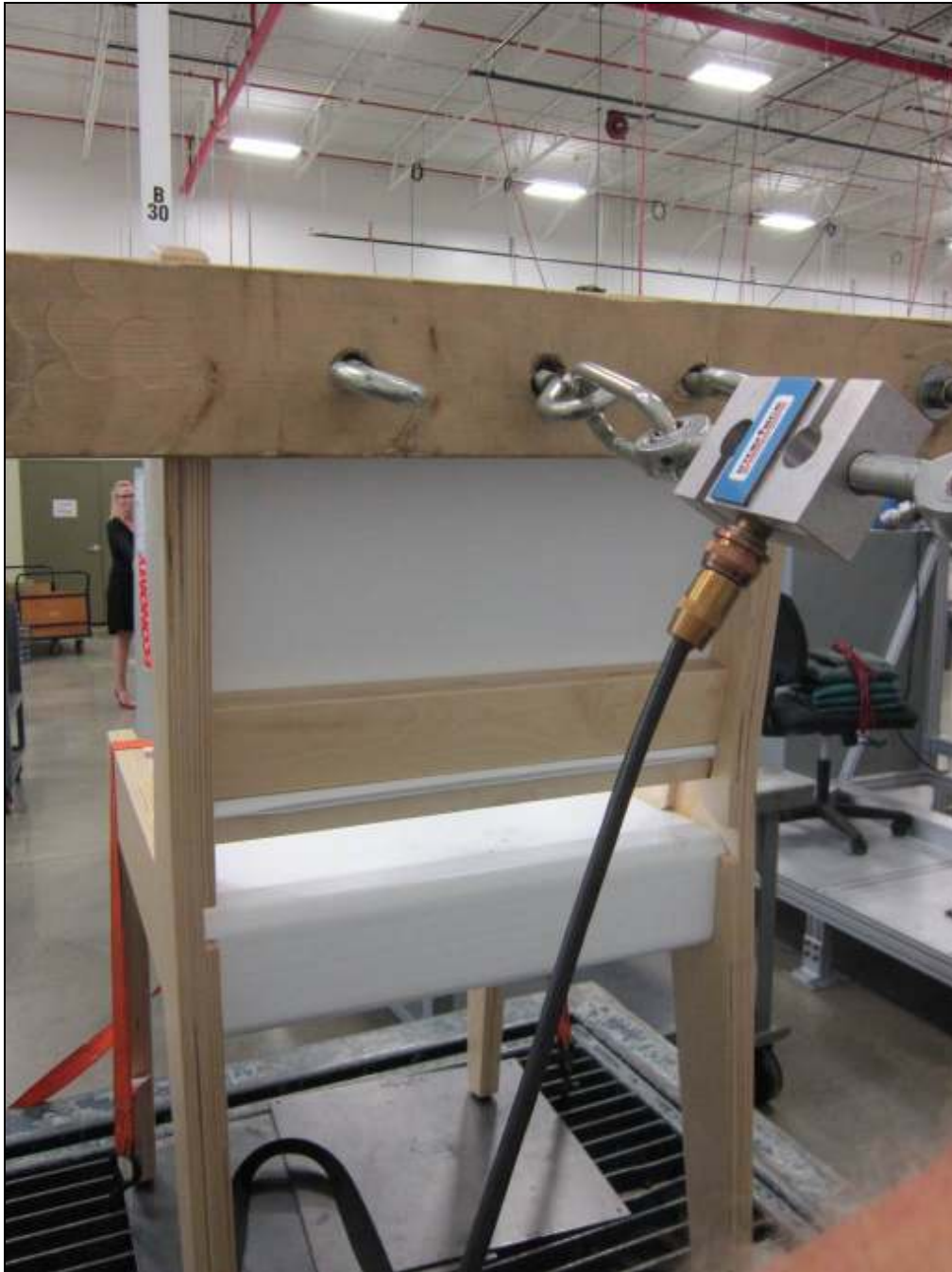
BACK STRENGTH PROCEDURE - STATIC