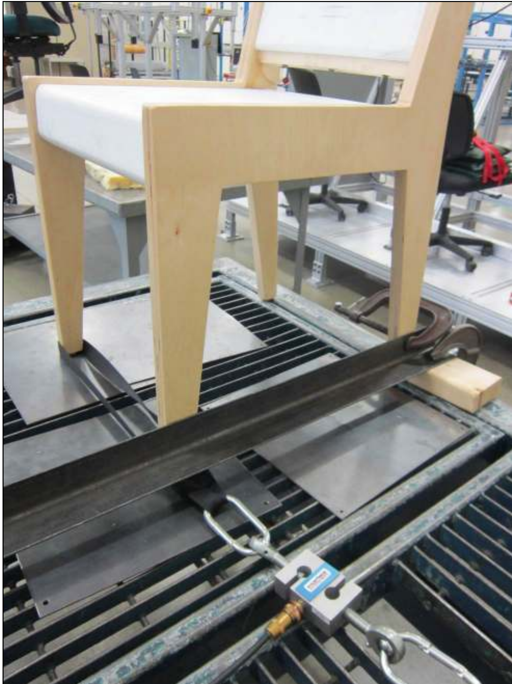
LEG STRENGTH TEST