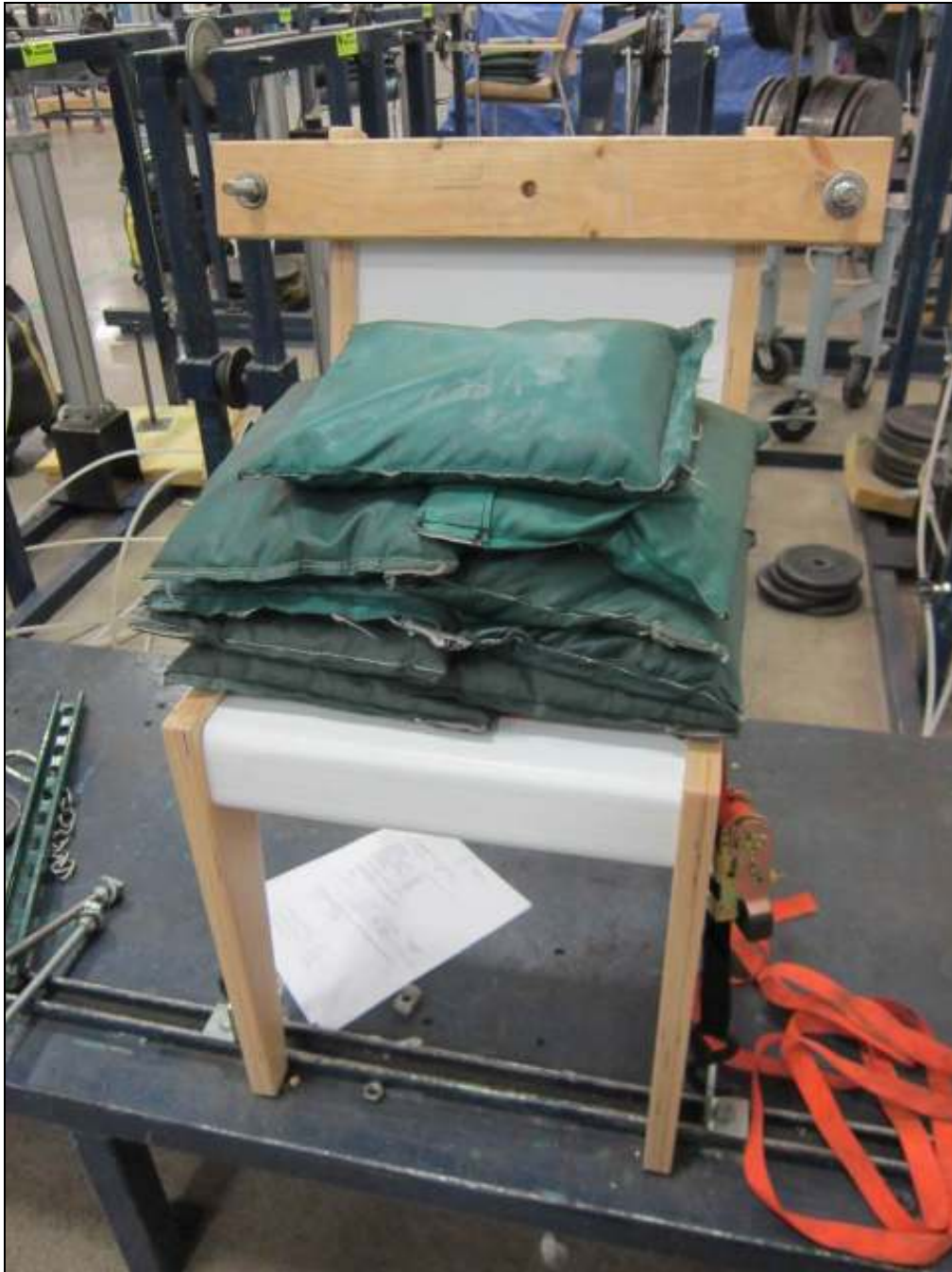
BACK DURABILITY TEST-CYCLIC