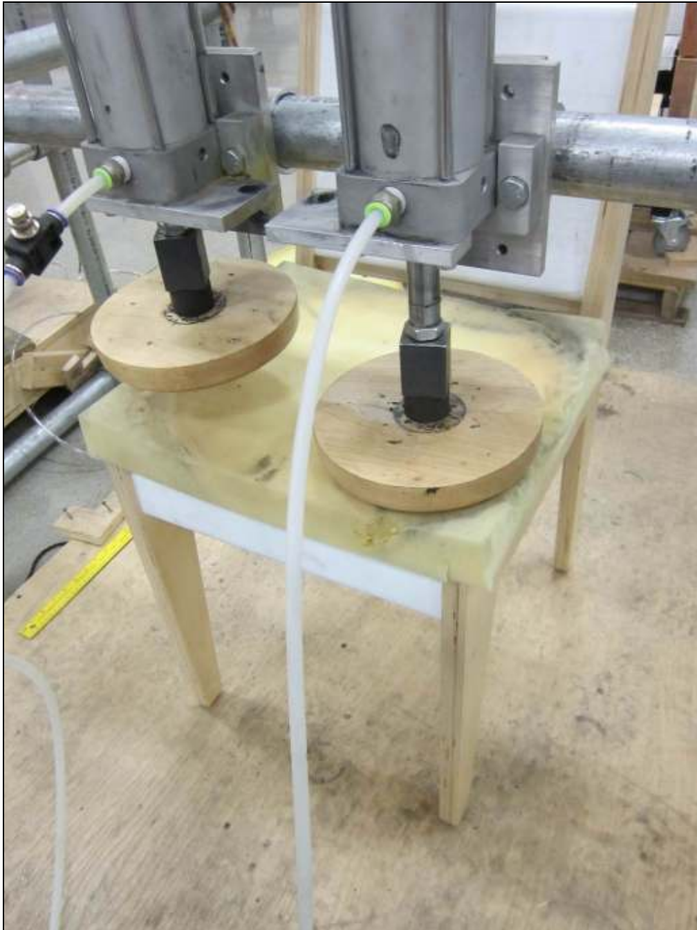
Load Ease Test